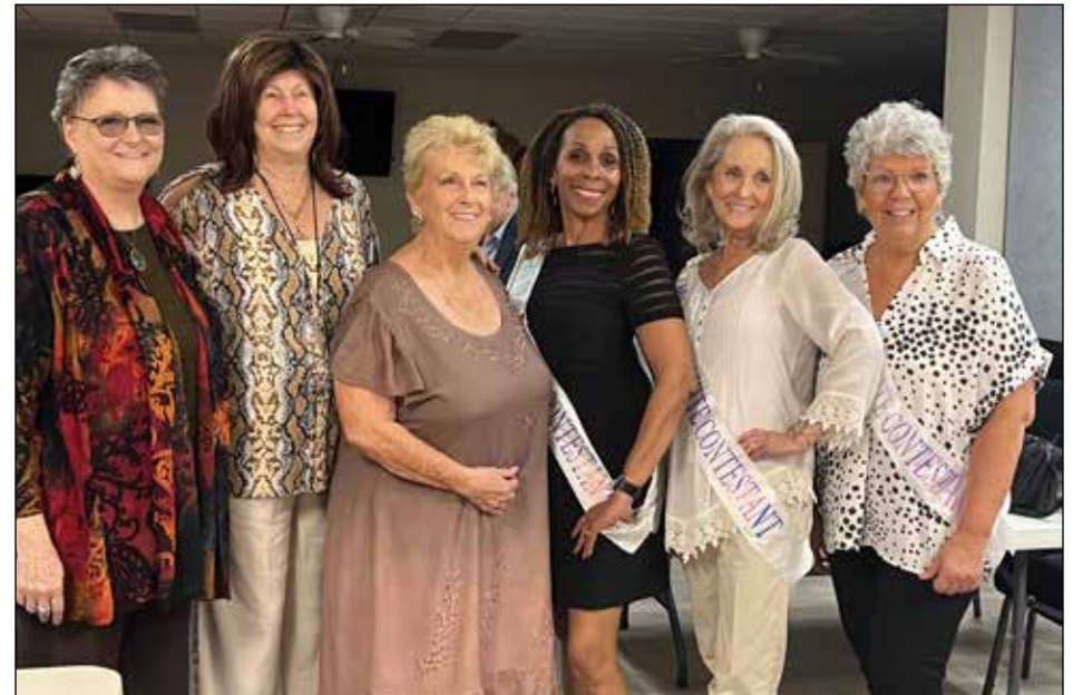
The Ms. Senior Mesquite board and contestants from 2024.