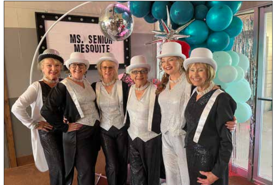
The Mesquite Showgirls always come out to usher and greet at the Ms. Senior Mesquite Pageant. (Submitted photo)

No ofrecemos todos los planes disponibles en su área. Actualmente representamos a 12 organizaciones que ofrecen 57 productos en su zona. Por favor, póngase en contacto con Medicare.gov, 1-800-MEDICARE o su Programa Local de Seguro de Salud (SHIP) para obtener información sobre todas sus opciones.