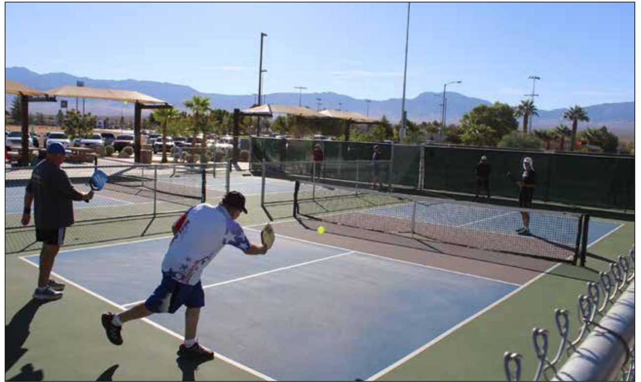
Pickleball will be scheduled March 24-26.

Those looking to sign up can go to the Mesquite Senior Games website and click the "Events" tab to find the specific sport or event they want to par-