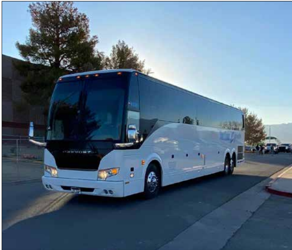
The charter bus takes off to take the Virgin Valley High football team to travel 10 hours to face Truckee in the state semifinals. The Bulldogs lost, 41-27. (Mesquite Athletics & Leisure Services)