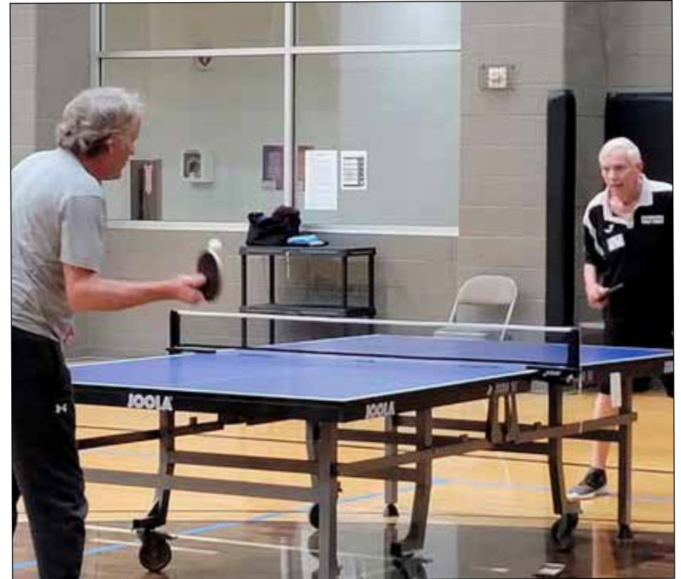
Table Tennis kicks off the 14-event schedule for Mesquite Senior Games on March 8.