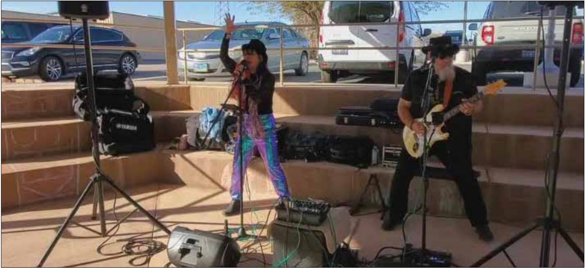
The Mesquite Cafe Blues Band has performed regularly at the Mesquite Library in the past few years. (Submitted photo)