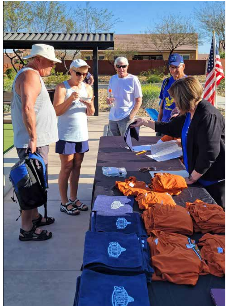
It takes a lot of volunteers to pull off each event at the Mesquite Senior Games, which kick off this month.