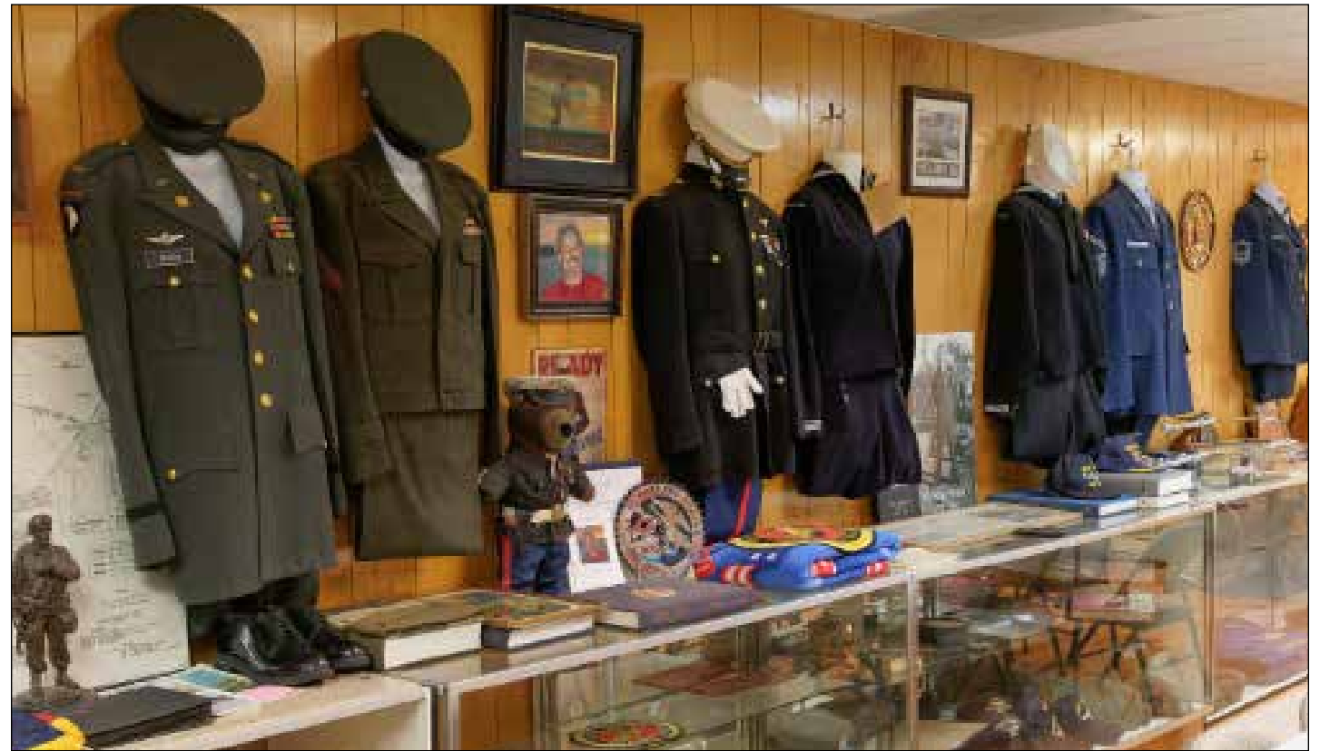
DAR & Poker Boys Unite for Veteran Center Celebration.

"At this time, it's especially important to support the Veteran Center because they're expanding their service area from the Utah border to Moapa Valley. With such an increased area to cover they'll need