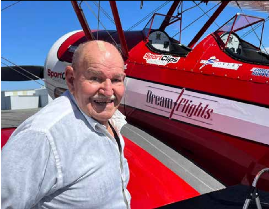
Eight veterans were honored with dream flights over Mesquite on Monday, Sept. 25. Ageless Aviation Dreams Foundation has given 6356 Flights to date.