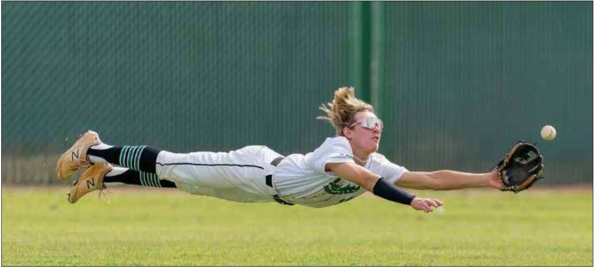
The Virgin Valley High baseball team played in the state tournament for the second straight year.