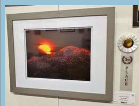
Third Place- "Bad Moon Rising" by Randy Bauman