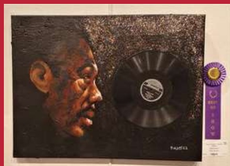
Best of Show - Duke Ellington, 'Jubilee' by Floyd Johnson