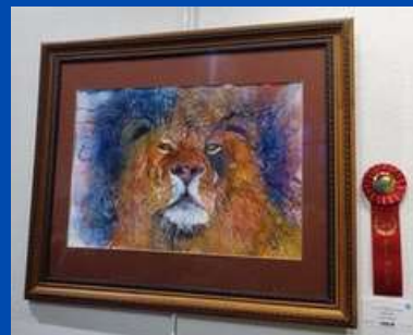
Second Place- "The Lion Sleeps Tonight" by Cheryl Sachse