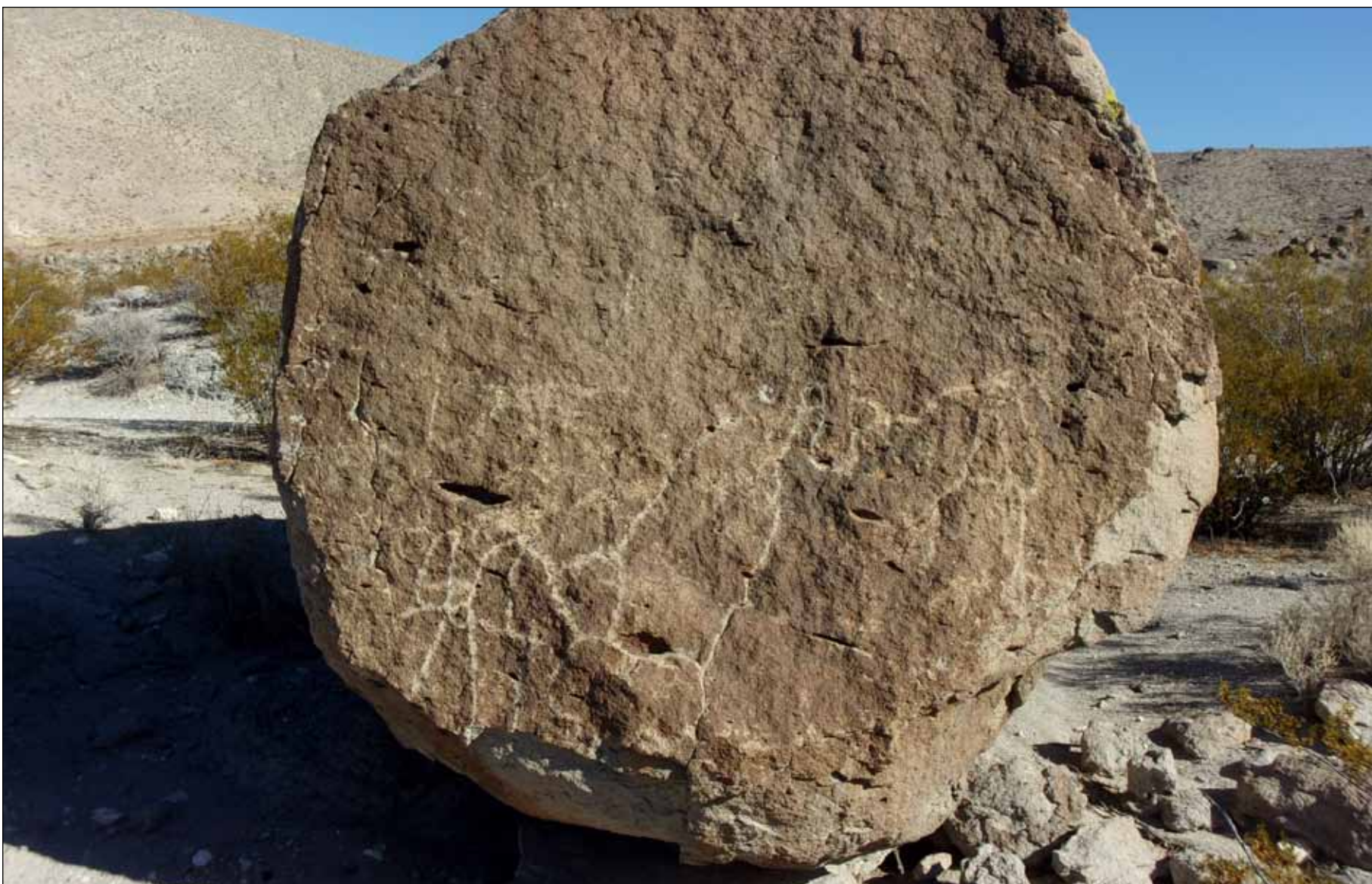
Ash Springs, located in Lincoln County near Alamo, has a number of petroglyphs that are hundreds of thousands years old.